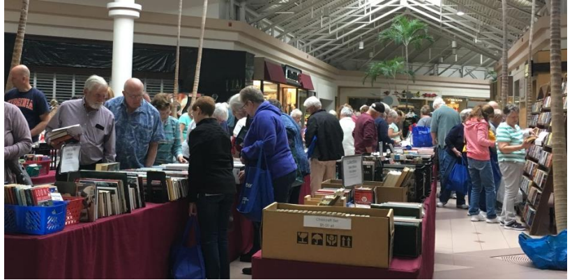
Friday morning is always the busiest time at the book sale.

Various local agencies and Friends of the Standish Library received the leftover books.