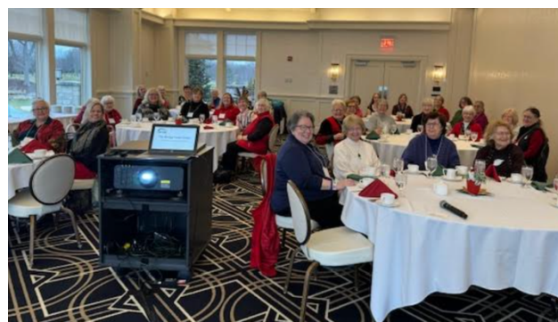
39 people were in attendance—this is close to a record!