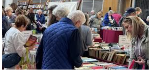
Eager shoppers perusing our many tables

Branch members, spouses and friends listed below are to be thanked for their contributions towards the success of the Spring sale. Thank you to the newer members who helped with the sort room and the sale. A special thanks to the Exchange Club for bringing out the banana boxes and for helping to put books out on the tables.