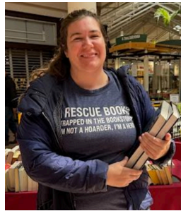
A shirt after our hearts